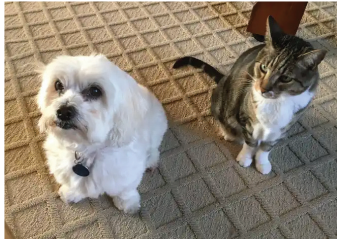
Winnie (left) and Tobey (right).