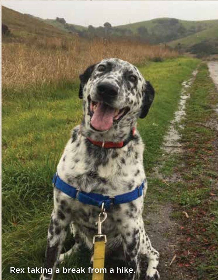
Rex taking a break from a hike.

The Doggy Day Out program was a huge win for everyone. The dogs had new friends and advocates. The photos captured the community's imagination. Within weeks, the program had swelled to 91 volunteers.