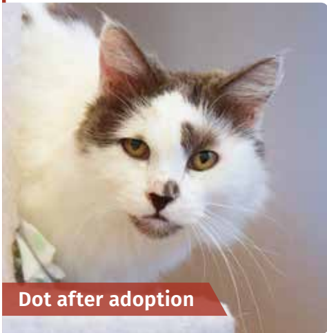
Dot after adoption

Thanks to a kind neighbor, a willing adopter and incredible friends like you who support our work, Dot will live out the rest of her life being loved and cared for.