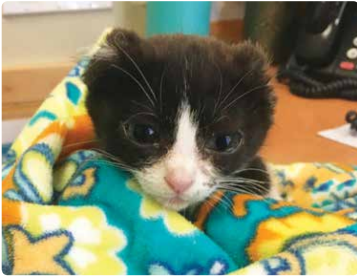
Karma at 6 weeks old