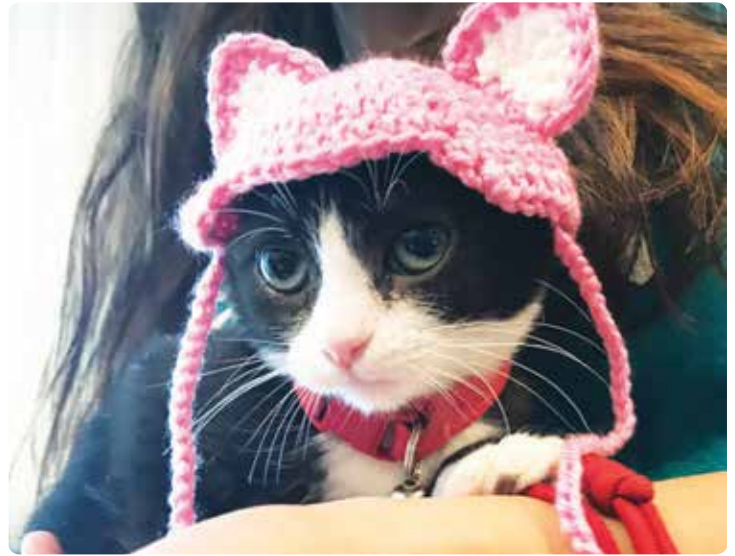
Karma's adoption day