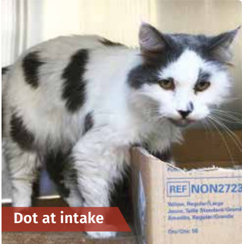
Dot at intake

When Dot, Phantom and Fanta's owner passed away, these sweet cats had no one to look after them. That is, until the neighbor who was caring for the cats reached out to us to help her find a permanent home for the trio. When we agreed to take in Dot, Phantom and Fanta, the wonderful neighbor not only brought the cats to us, but gave a generous donation for their care.